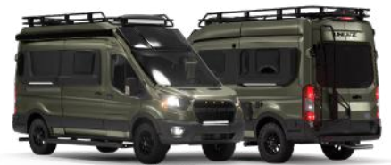
WILD GREEN SAFARI RACK - STANDARD