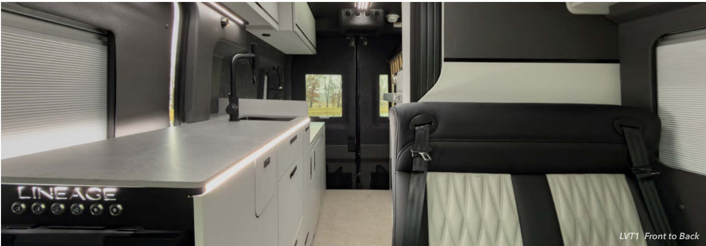
LVT1 Front to Back