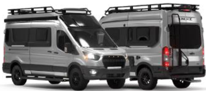
AVALANCHE GRAY SAFARI RACK - STANDARD