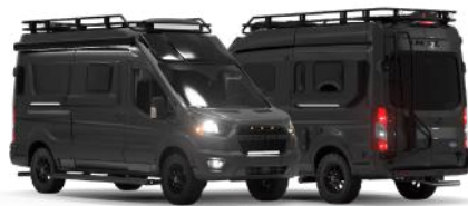
CARBONIZED GRAY SAFARI RACK - STANDARD