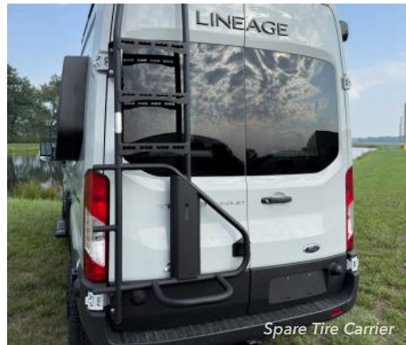
Spare Tire Carrier