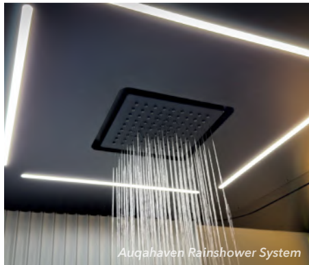
Auqahaven Rainshower System