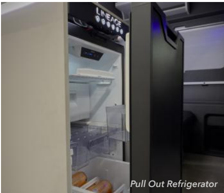
Pull Out Refrigerator