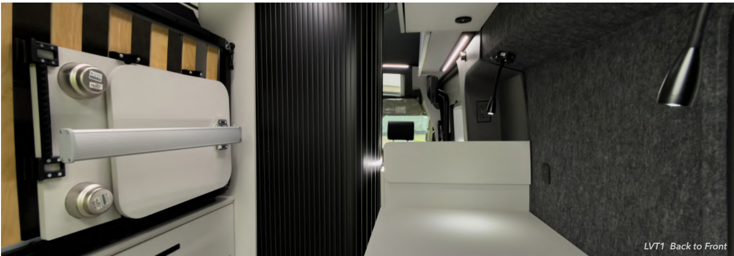
LVT1 Back to Front